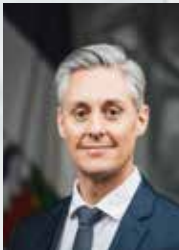
HONOURABLE RJ SIMPSON Premier Minister of Executive and Indigenous Affairs Minister of Justice Government House Leader

The selection process maintained regional balance, with two Ministers chosen from northern ridings, two from southern ridings, and two from Yellowknife.