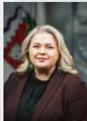
HONOURABLE CAITLIN CLEVELAND Minister of Industry, Tourism and Investment Minister of Education Culture and Employment