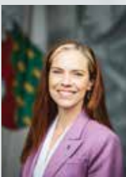
CAROLINE WAWZONEK Yellowknife South