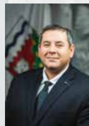
HONOURABLE VINCE MCKAY Minister of Municipal and Community Affairs Minister Responsible for Workers' Safety and Compensation Commission Minister Responsible for the Public Utilities Board