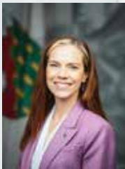
HONOURABLE CAROLINE WAWZONEK Deputy Premier Minister of Finance Minister of Infrastructure Minister Responsible for the Northwest Territories Power Corporation