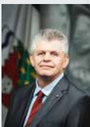
HONOURABLE JAY MACDONALD Minister of Environment and Climate Change