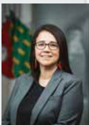
HONOURABLE LESA SEMMLER Minister of Health and Social Services