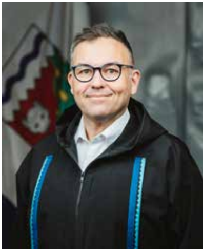
Glen Rutland, Clerk of the Northwest Territories Legislative Assembly