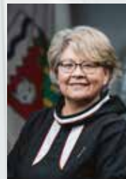
HONOURABLE LUCY KUPTANA Minister Responsible for Housing Northwest Territories Minister Responsible for the Status of Women