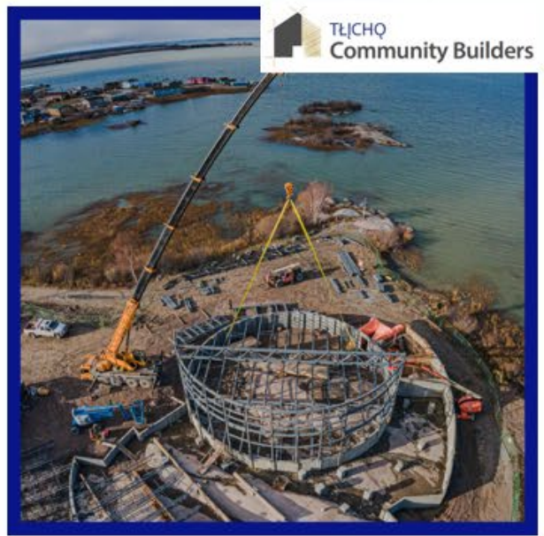
Tłı̨chǫ Cultural Center Construction