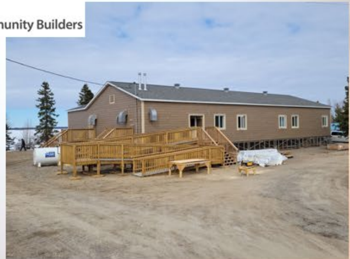
Gameti Motel Construction