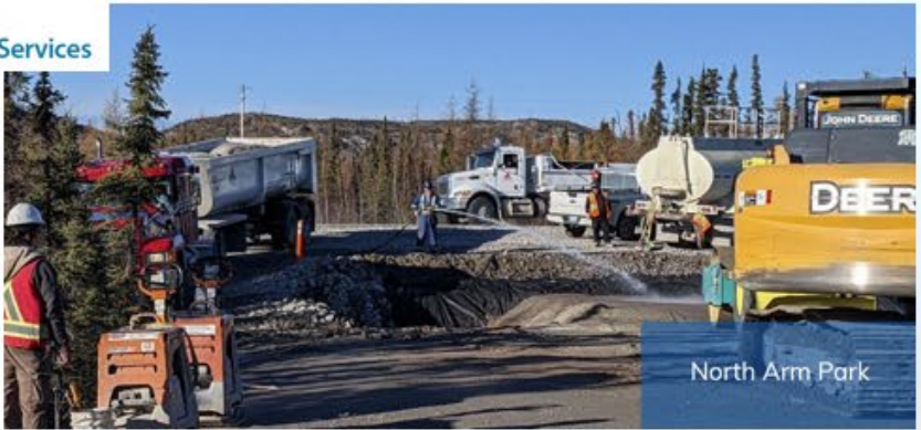
North Arm Park