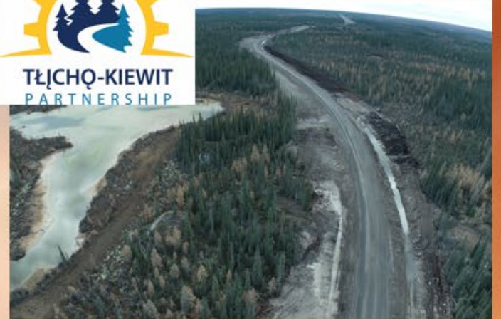
Tłı̨chǫ Highway Construction