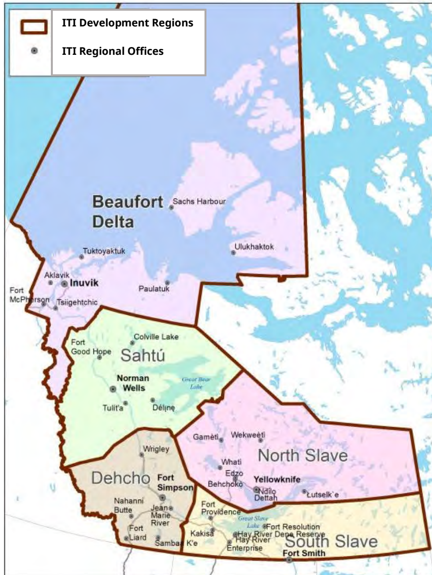
Figure 1: Map of the NWT Administrative Regions