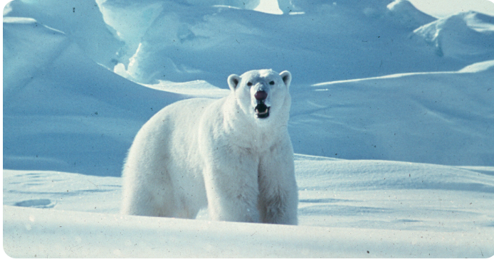
Polar bear

Under subsection 16(1) of the Species at Risk (NWT) Act , the Conference of Management Authorities (the Conference) must submit an annual report to the Minister of Environment and Natural Resources by September 30 each year. This annual report covers the fiscal year ending March 31, 2020.