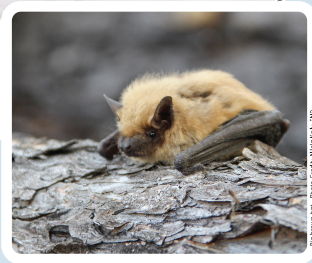
Big brown bat