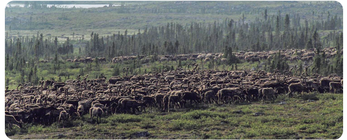
Barren-ground caribou

The Species at Risk (NWT) Act provides a process to identify, protect, and recover species at risk in the Northwest Territories (NWT). The Act applies to any wild animal, plant, or other species that is managed by the Government of the Northwest Territories. It applies in most areas of the NWT, on both public and private lands, including private lands owned under a land claim agreement.