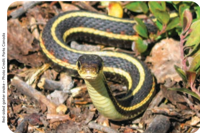
Red-sided garter snake – Photo Credit: Parks Canada

The Species at Risk (NWT) Act (the Act) provides a process to identify, protect, and recover species at risk in the Northwest Territories (NWT). The Act applies to any wild animal, plant, or other species managed by the Government of the Northwest Territories. It applies in most areas of the NWT, on both public and private lands, including private lands owned under a land claims agreement.