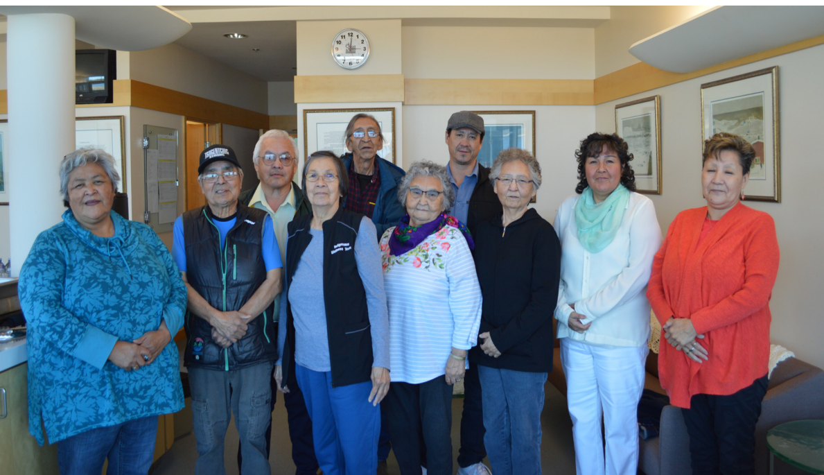
Our legislative interpreters

To enhance the delivery of official languages, two educational videos were released both in French and English during the 2021-2022 fiscal year.