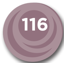
Motions Adopted in Committee of the Whole

The Assembly's first hybrid sitting occurred on March 28, 2022.