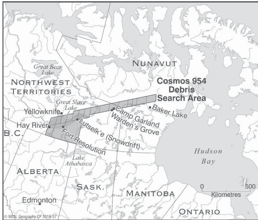
Figure 1. The Cosmos 954 debris field as covered by Operation Morning Light. The long upper arm represents the initial search area based on the satellite trajectory. This search area was later expanded south towards Alberta and Saskatchewan. Map by Charlie Conway.

The subsequent military-led effort to remove this widespread radioactive contamination was a laborious process. It involved hundreds of ground personnel and cost the Canadian government nearly $14 million. 3 Dubbed Operation Morning Light, the search for satellite debris lasted about eight months and encompassed a vast, remote swath of northern Canada. The operation required both extensive aerial surveys and the use of ground search teams, as well as the establishment of a temporary military base near the Thelon River. In April 1981 Soviet and Canadian diplomats signed a compensation settlement of $3 million to be paid from the USSR to Canada. 4 After that time, Operation Morning Light disappeared quickly from the media, though not necessarily from the memories of northerners, who had experienced the impacts of the crash and recovery mission firsthand.