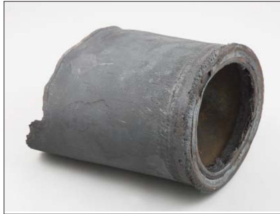
Figure 2. The “stovepipe,” as it was nicknamed, was one of the largest pieces of satellite debris found (measuring 70 cm in length and 30 cm in diameter). This non-radioactive fragment was discovered by a chance aerial sighting; the majority of the Cosmos 954 debris fell as radioactive particles approximately the size of pepper grains, which were impossible to detect without specialized equipment.

The Cosmos 954 episode flashed into visibility the connection of northern Canada, seemingly distant from Cold War geopolitics, with the geographies of militarization. Of course, by the late 1970s the North had a long history of such entanglements—whether as a theatre of military operations during the Second World War, the site of uranium mining for Allied nuclear weapons development, or the construction in the 1950s of the Distant Early Warning (DEW) Line radar system. 5 Northern environments and people were directly affected by these military–industrial activities: through pollution from uranium extraction and transport, for instance, or the legacies of construction and chemical wastes left at DEW Line stations, both of which in recent years have been the subject of local concern, scholarly analysis, and government clean up efforts. 6 The case of Cosmos and Operation Morning Light, however, remains relatively obscure, perhaps because of the seemingly accidental and ephemeral nature of the crash and cleanup. 7