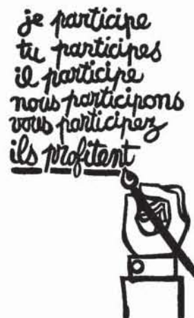
FIGURE 1 French Student Poster. In English, I participate; you participate; he participates; we participate; you participate . . . They profit.

There is a critical difference between going through the empty ritual of participation and having the real power needed to affect the outcome of the process. This difference is brilliantly capsulized in a poster painted last spring by the French students to explain the student-worker rebellion. 2 (See Figure 1.) The poster highlights the fundamental point that participation without redistribution of power is an empty and frustrating process for the powerless. It allows the power-holders to claim that all sides were considered, but makes it possible for only some of those sides to benefit. It maintains the status quo. Essentially, it is what has